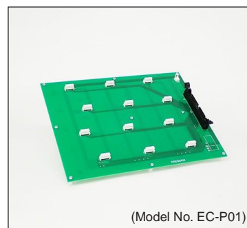
Test board for evaluation modules