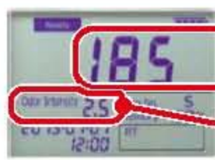
Image of Display