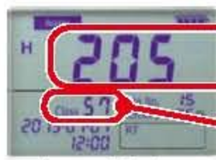
Image of Display